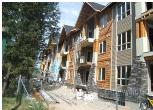
Phase II—Facing South

The exterior is progressing with much of the south and east side completed. The exterior stone work is also nearing completion. Work on the installation of the fireplaces should begin soon. The trades continue to work cooperatively as they did in Phase I.