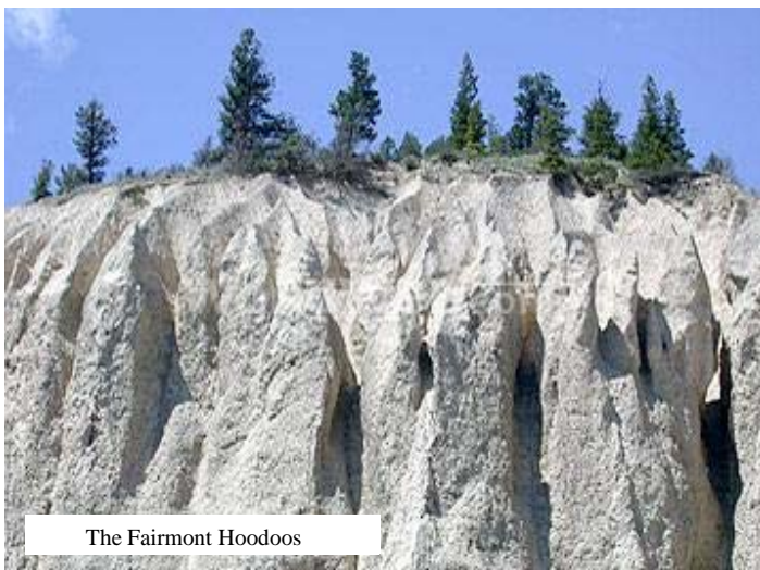
The Fairmont Hoodoos