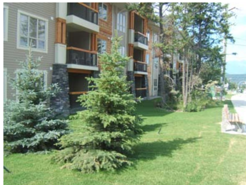
Phase I—Facing North